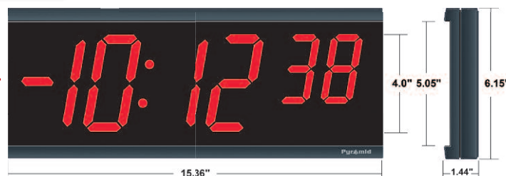
4" High Characters x 6 Digits