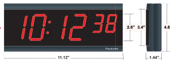
2.5" High Characters x 6 Digits