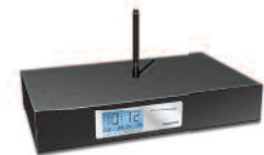
PYRAMID TIME & ATTENDANCE PAYROLL SYSTEMS